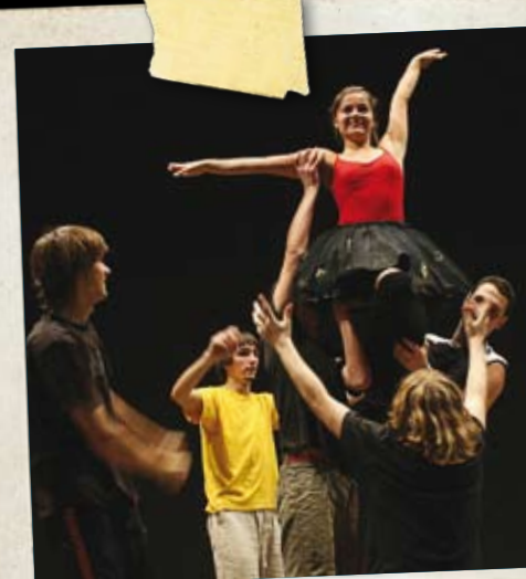
Ice and Fire at Heritage Sites Applicant: Kuldiga Culture Center, Latvia

In April 2008 Helsinki Centre Youth held a seminar which concentrated on the demographic challenges Europe and the Nordic countries are facing. Will the demographic trend represent better conditions for ethnic minorities? What should be the attitude of foreigners to the language and work culture of their new country? At the seminar the participants discussed, amongst other things, different theoretical subjects related to the labour market. The delegates came from Denmark, Estonia, Finland, Iceland, Northwest Russia and Sweden.