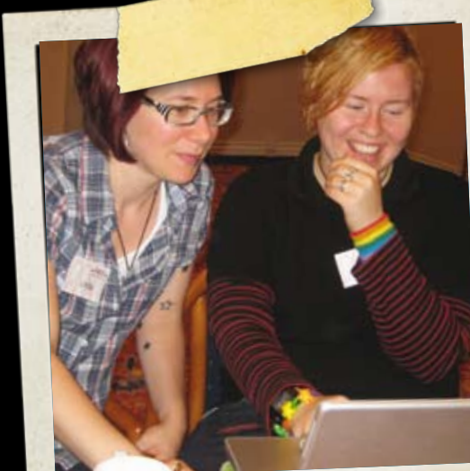
Students for Transgender Inclusion Applicant: ANSO, Association of Nordic LGBTQ Student Organization, Denmark

From 8 - 10 August 2008 the Norden Association Norrbotten held a conference in Haparanda in Sweden on the theme of global competition and climate changes. The conference delegates discussed how the North Calotte region is affected by globalisation and how regional Nordic co-operation could create conditions for a competitive and environmentally responsible Nordic Region.