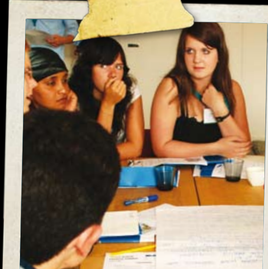
Global Competition and Climate Changes Applicant: The Norden Association, Norrbotten, Sweden

Kuldiga Culture Center gathered young people with an interest in art from Sweden, Denmark, Iceland, Estonia, Latvia, Lithuania and Russia at a seminar where the participants had the chance to make a contribution to a greater understanding of the common Nordic culture. Furthermore, they worked to get more young people interested in art, culture and the joint Nordic heritage. This all took place in Kuldiga in Latvia from 30 November to 2 December 2007.