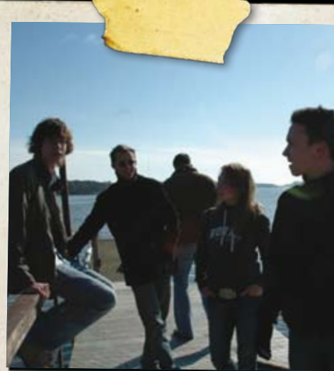
Young Foreigners in Aging Europe Applicant: Helsinki Centre Youth, Finland

In April 2008 Helsinki Centre Youth held a seminar which concentrated on the demographic challenges Europe and the Nordic countries are facing. Will the demographic trend represent better conditions for ethnic minorities? What should be the attitude of foreigners to the language and work culture of their new country? At the seminar the participants discussed, amongst other things, different theoretical subjects related to the labour market. The delegates came from Denmark, Estonia, Finland, Iceland, Northwest Russia and Sweden.